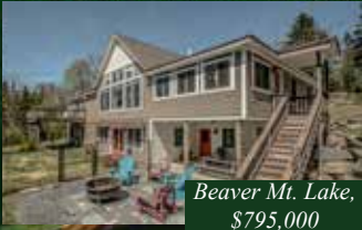
Beaver Mt. Lake, $795,000