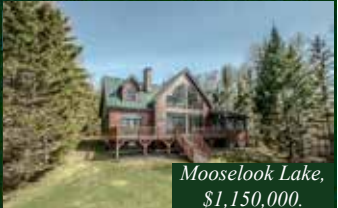
Mooselook Lake, $1,150,000.

We are the only Family-Owned & Operated Real Estate business in the Rangeley Area. Under the same ownership for over 30 years, we are dedicated to helping our customers find the perfect home to rent or buy in the Rangeley Lakes Region. Call us today for all of your Real Estate and Vacation Rental needs!