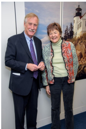
Senator King and Maggie Shannon in DC

The law which protects intermittent headwater streams and wetlands, the Clean Water Rule (WOTUS), is headed for repeal by Congress. However small and seemingly insignificant they seem, headwater streams are feeders for the entire aquatic system. If they are abused, built over, or loaded with nutrients, the quality and quantity of all downstream waters will be affected, and the breeding habitat for Eastern brook trout will disappear. WOTUS also protects wetlands which save the public more than $500,000 annually through nutrient uptake and flood control.