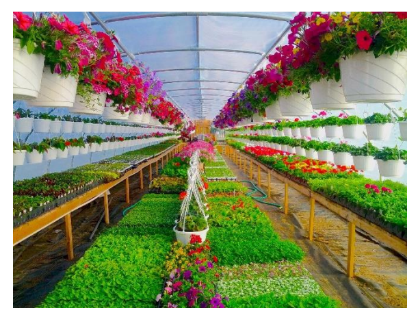
2Lemek Greenhouse, Tolland

A top priority for this committee should be encouraging provision of sufficient infrastructure to enable the success of the farming community. One specific opportunity to provide this infrastructure is equipment sharing between farmers. As large equipment can be extremely expensive, creating opportunities for cost sharing and collective financing could be extremely impactful for farmers in reducing overhead costs. The group should work to gauge interest within the agricultural community and guide the farmers in creating coownership agreements, schedules and other requirements for use, etc. One example that emerged during the process of creating the plan is the idea of a slaughterhouse. This slaughterhouse could be at one fixed location, open for use by the region's livestock keepers, or mobile, allowing it to be