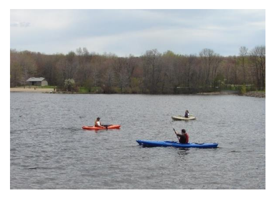
1Bolton Lake

While the discussion has largely been around attracting visitors to the region's outdoor assets, resident and workers within the region also play a significant role in its economic growth. Users of these assets are drawn into the community where they spend their disposable income at local businesses. By creating more engagement around these opportunities, this economic growth can occur.