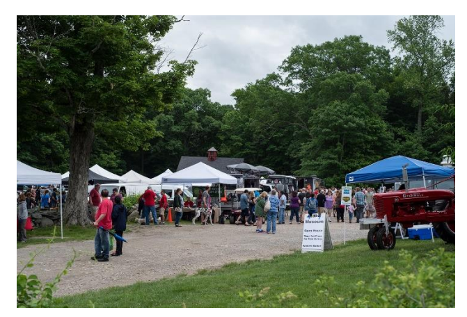
3Coventry Farmer's Market

may also consider engaging school systems and Parks and Recreation Departments outside the four town region in communities with different demographic makeups in order to reach a more diverse audience.