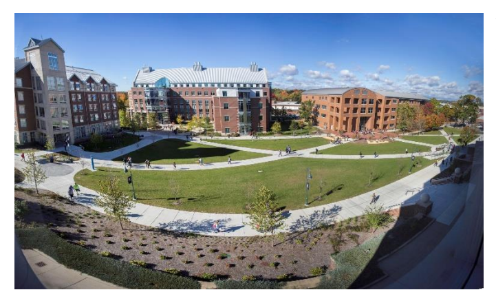
6Eastern Connecticut State University, Windham

The presence of the University of Connecticut within the region as well as the nearby Eastern Connecticut State University creates a unique and desirable economic opportunity. The region benefits in many ways because of this: through a significant young adult presence, through a wealth of intellectual capital and the resulting potential for start-up activity, through the presence of two large employers, and through possible interest in government investment in the region to support these institutions, to name just some.