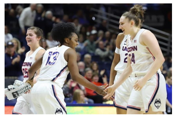
4UConn Women's Basketball

What follows are recommendations designed to create a