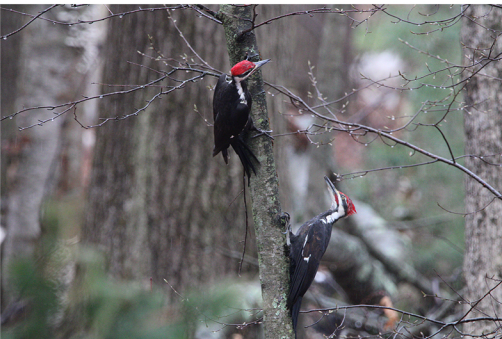
3rd Place- "A Pair of Pileated Woodpeckers" by Eftrain Vazquez