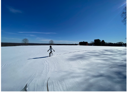
2nd Place- "A "bluebird day" snowshoe hike" by Scott Livingston