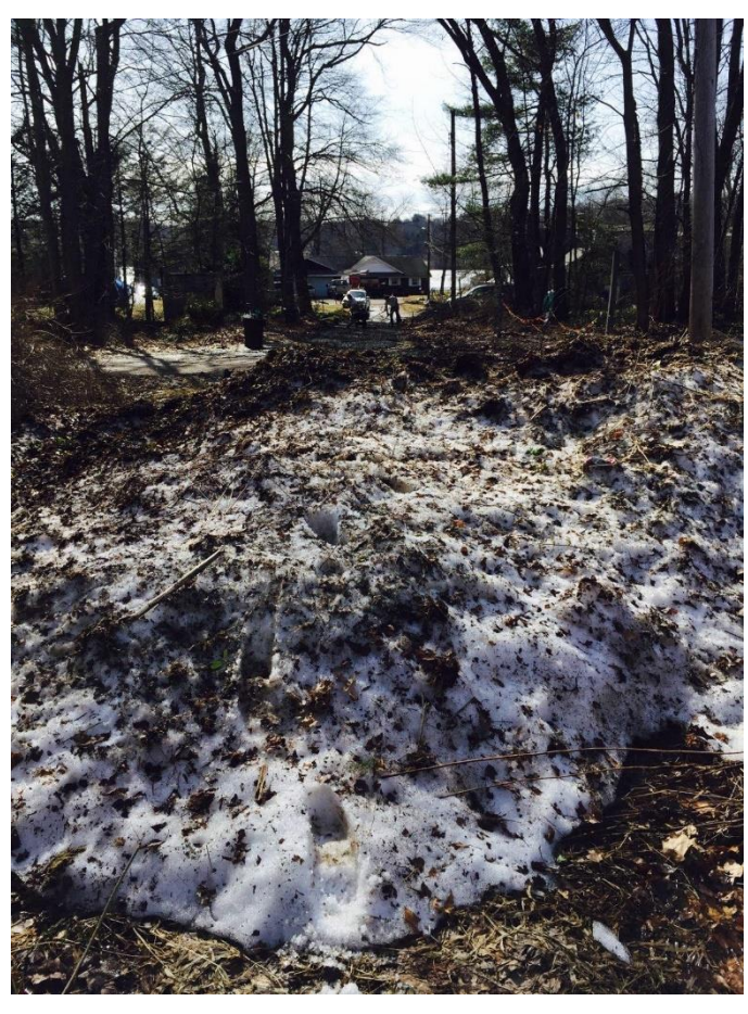
Figure 8 Late Winter Blockage