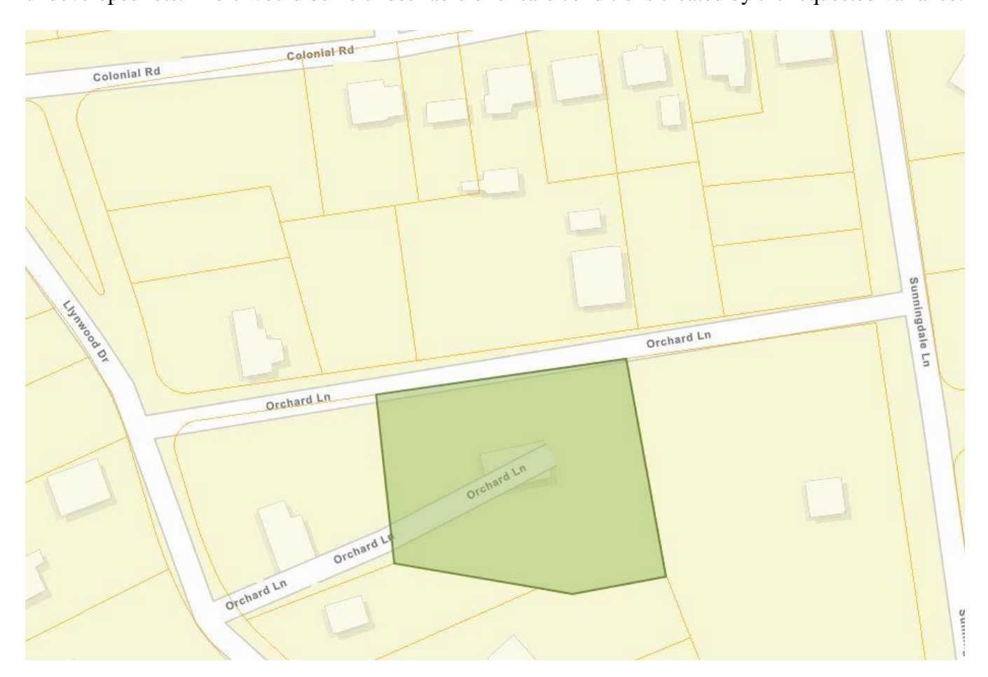
Figure 10 GIS Map of Orchard Lane Neighborhood