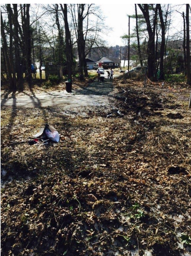
Figure 6 Orchard Lane Showing Blockage and Condition Before Owners Maintenance