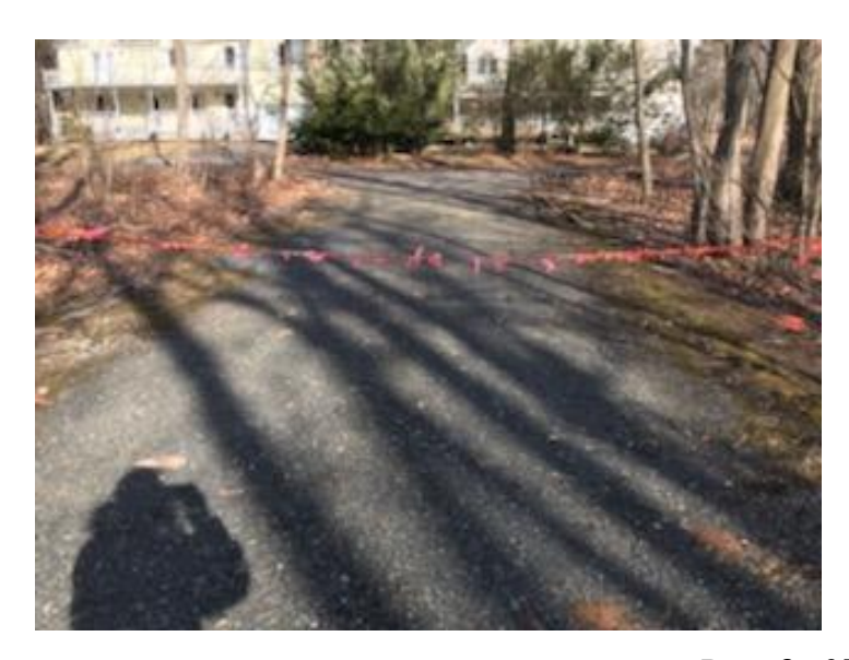
Figure 5 View of Chain Across Orchard Lane Facing East

While the loss of a home and much of its contents is certainly a hardship the request for a variance from the zoning regulations requires a "hardship" which is inherent in the property itself and not caused by the owners. In this instance that "hardship" is the location of the house to be rebuilt being on Orchard Lane itself and having frontage on no other access. Orchard Lane is what is called a "paper road" which has never been accepted by the Town of Bolton. It was laid out by the Holl family as part of the Rosedale development before Bolton adopted zoning. It has been abandoned by the heirs to the Holl estate and now has no accepted ownership and no one pays taxes on it. However, it is the only access to the property in question, and the portion of Orchard Lane used to access this property is maintained by the owners and their tenants. Passage through the length of Orchard Lane is impeded both by the debris left by the snow plowing and more specifically by a chain placed across it by a neighbor. The town has on several occasions refused to ask for removal of this chain. In practice, Orchard Lane is not a fronting roadway but rather an unowned driveway. Figures 5 – 8 document these conditions.