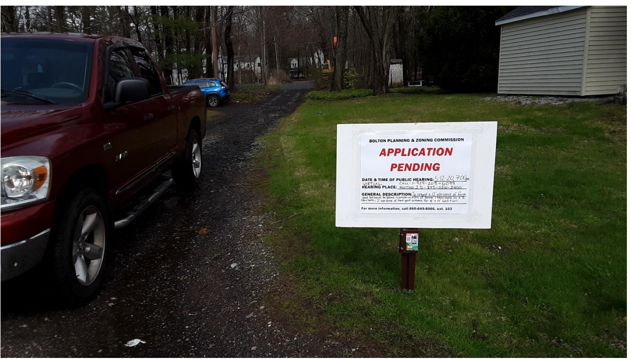
Figure 9 ZBA Hearing Sign in Place Page 5 of 7