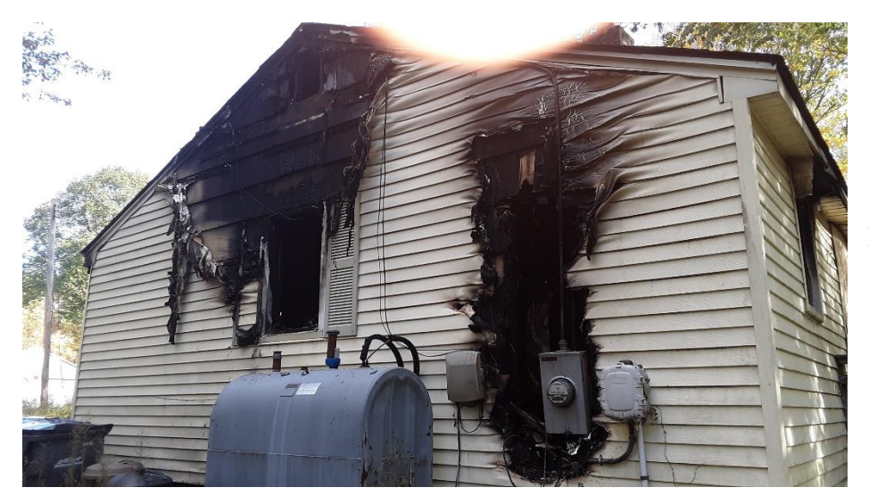
Figure 3 Location of Start of Fire

Shortly thereafter the house was seen in flames as the electrical surge reached the house, exploded the main circuit panel through the exterior wall, and extended the fire into the attic (Figure 3).