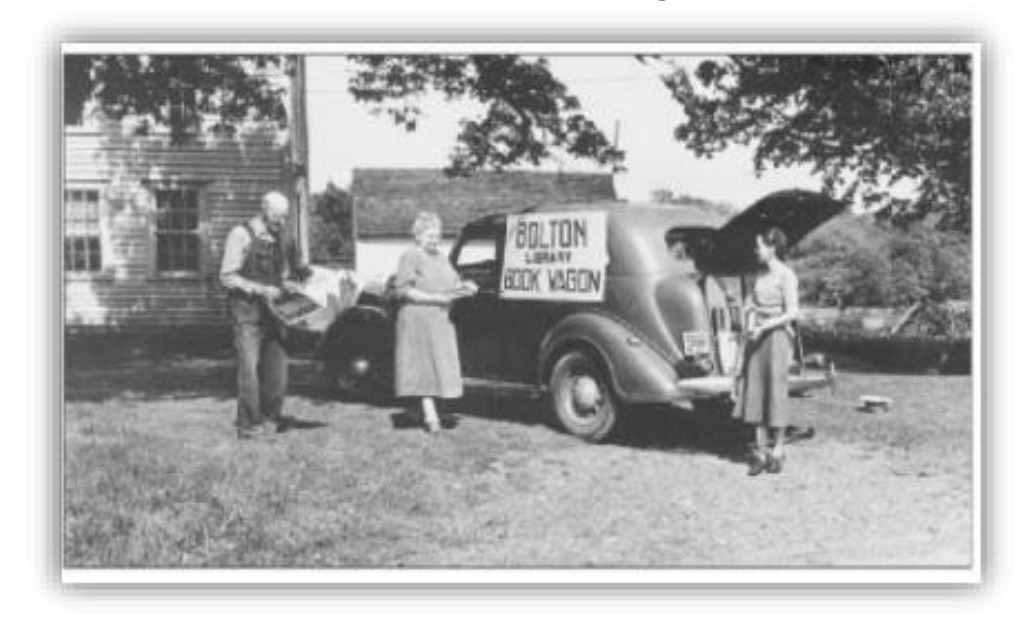
The Bolton Book Wagon

The next board meeting will be held (via Zoom) on Tuesday, June 9, at 4:00 p.m. Anyone interested in joining the meeting can email the library to register and receive the Zoom link.