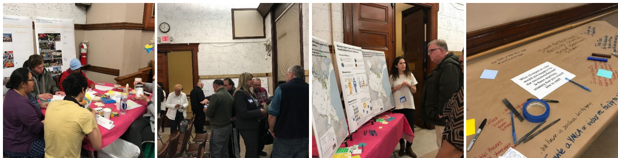
Figure 7: Revere OSRP Community Forum