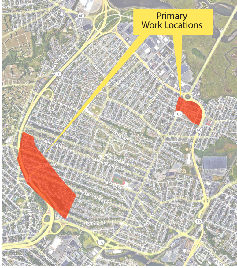
Map data Google©2023