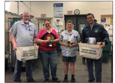
United Way partners with USPS to Stamp Out Hunger.