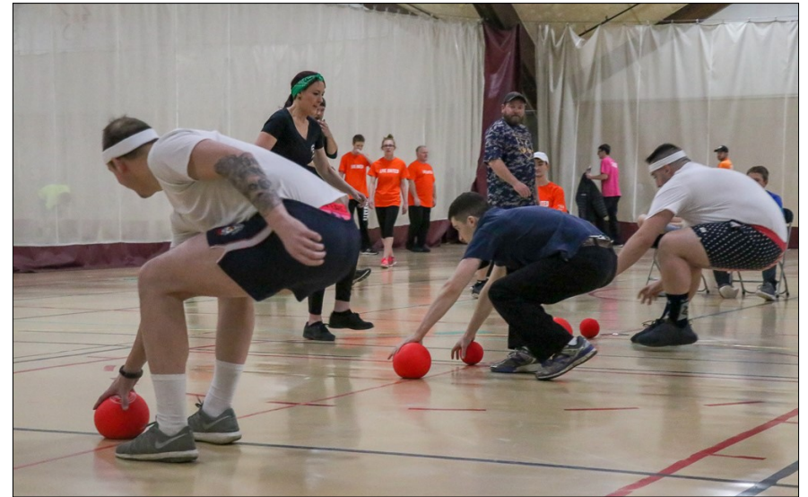
The action is always fast and furious at the United Dodge Ball Tournament.