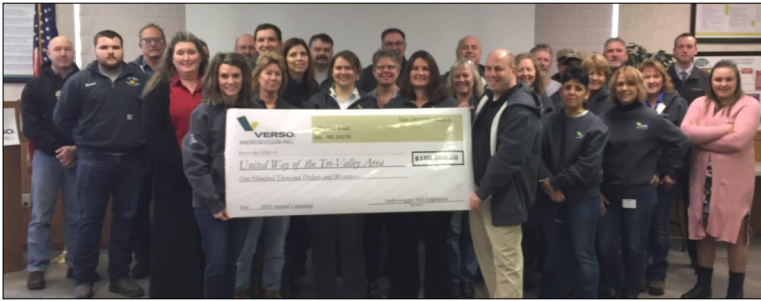
Verso Androscoggin Mill employees are the largest Campaign contributors to United Way.