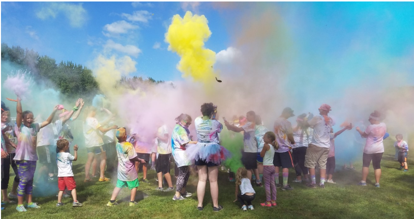
Participants colorfully celebrate the finish of the Color Me United 5K.

A little change can add up to a lot. Do you have a business or organization that would volunteer to host a Community Change Challenge jug? You just might win a coveted trophy and get to designate the money your organization raises to a United Way Community Partner.