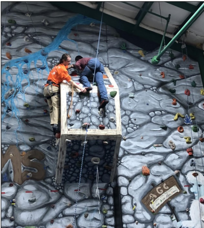
The Adaptive Outdoor Education Center helps climbers of varying abilities reach new heights.