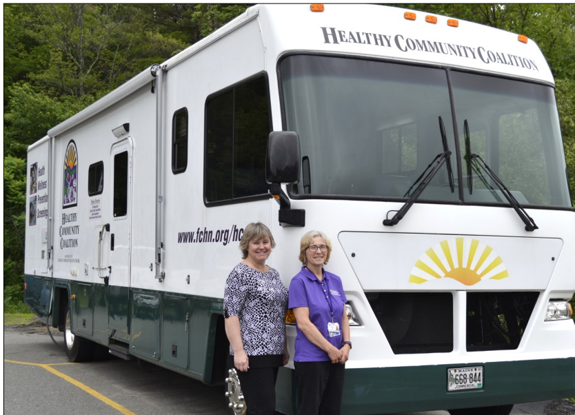
Healthy Community Coalition's Mobile Health Unit.

At the core of what United Way does is make community investments to what are called Community Partners. Partners apply annually for program support and must be 501(c)(3) non-profit organizations. UWTVA is proud to currently support the following Community Partners: