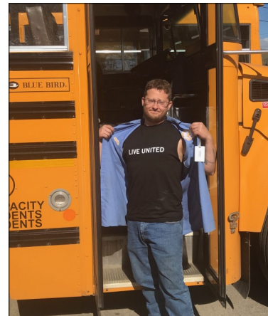
All over Greater Franklin County people are joining United Way to fight for high quality education, health, and financial stability.