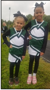
Hope Fund recipients appreciate the support of UWTVA.