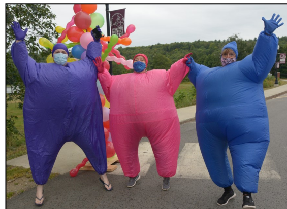
Community Care cards were distributed to frontline workers throughout the pandemic.