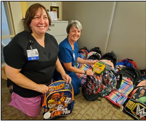
Franklin Memorial Hospital employees generously support United Way's Packs for Progress program.