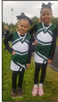
Hope Fund recipients appreciate the support of UWTVA.