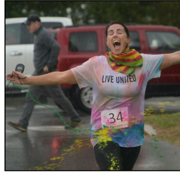
The annual Color ME United 5K draws people from all over the state for a colorfully good time.