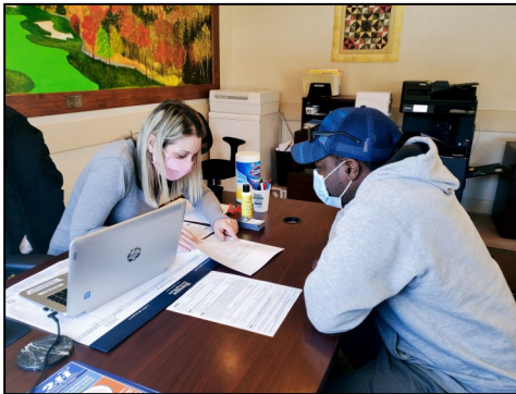
United Way and New Ventures Maine partner to offer free tax preparation to low and moderate income families. Volunteers help filers earn, keep, and grow their hard earned money.