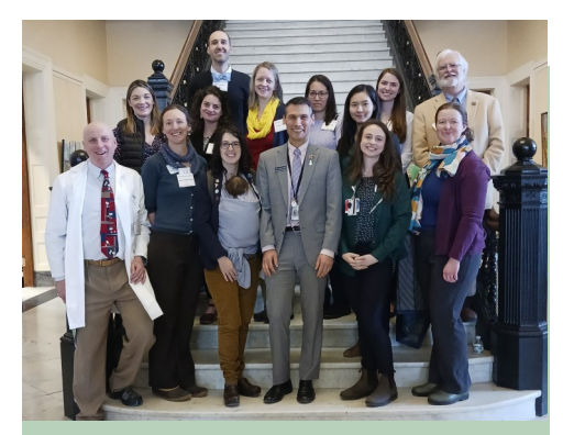
Advocacy Day at the Statehouse 2023