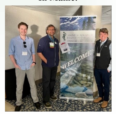
Northern Light-EMMC Family Medicine Residents Attending MAFP's Annual Educational Conference