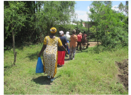
Walking in the bush to each widow's hut and bringing food...

Many of the sponsored widows thanked God over and over for the help they've been receiving. The parents and children thanked God for the funds to be able to attend school. The sponsorship money really makes a difference to each of them. One joyful visit was to a widowed mom of five. She is sponsored, as are all five of her children so she was just beaming with gratefulness! The website is now updated with the widows and children who need sponsoring. We pray that all of them be-