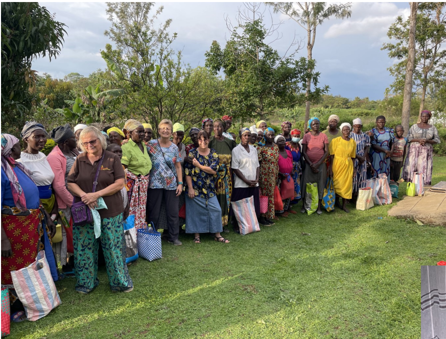
The group of widows at the support group. (left)