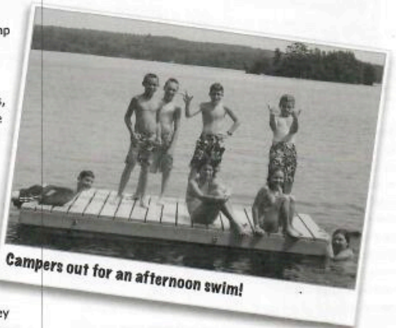
Campers out for an afternoon swim!