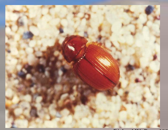
19 Large Aegialian Scarab Beetle (Aegialia magnifica)