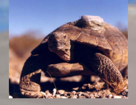
Kristen Murphy, 1997

In addition to the Big Dune beetles, elevations below 5,000 feet in Southern Nevada are home to the largest living reptile in the arid southwest – the desert tortoise.