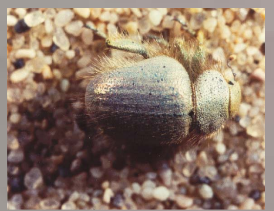
Rulien's miloderes weevil (Miloderes rulieni)