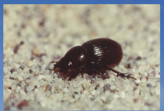
Richard W. Rust, 1994 Big Dune aphodius scarab beetle ( Aphodius sp.)

Vegetation around and on the dunes includes creosote bush ( Larrea tridentata ), sandpaper plant ( Petalonyx thurberi ), prickly poppy ( Argemone corybosa ) and astragalus ( Astragalus lentiginosus var. variabilis ).