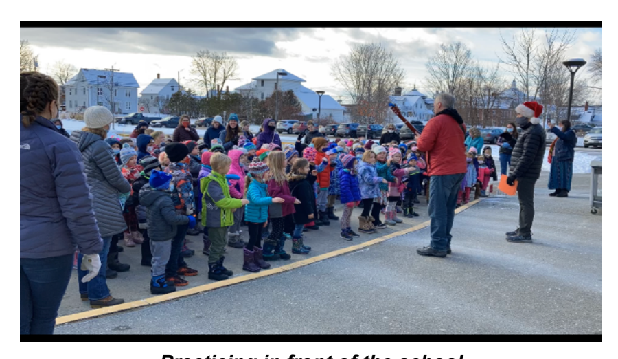
Practicing in front of the school