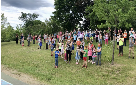
< Our first 'normal' event June 2021.

* Mallett School began and ended the year with hybrid learning. In the hybrid model we had about 249 in-school students (about half each day). In Remote Academy there were 39 Mallett participants. Home-schoolers totaled 27.