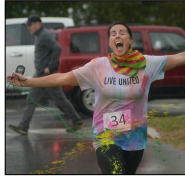
The annual Color ME United 5K draws people from all over the state for a colorfully good time.